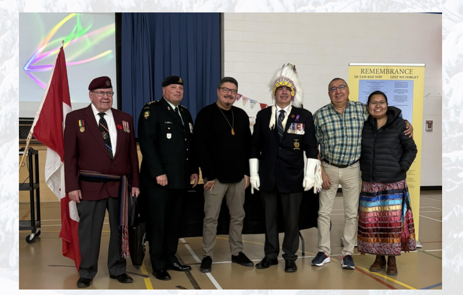
Indigenous Veterans Day @ Park Meadows