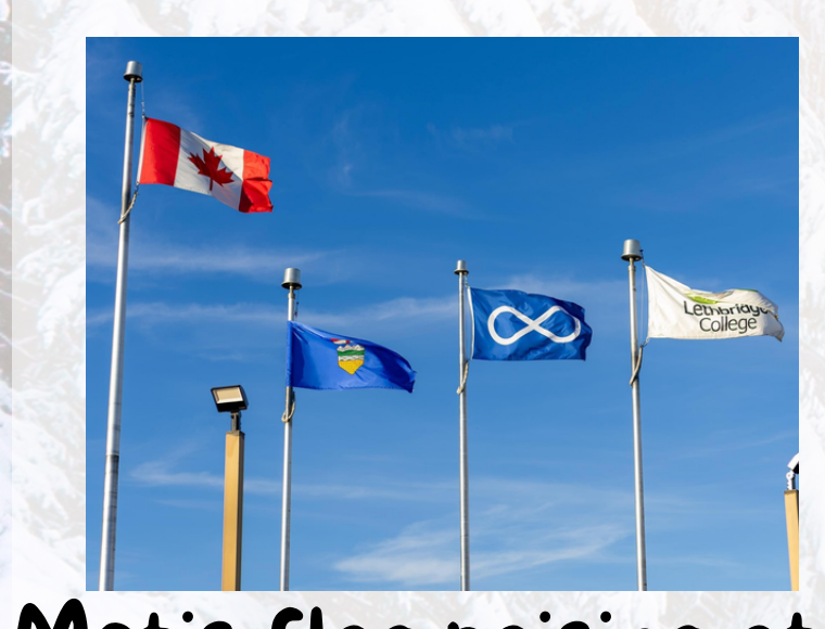
Metis flag raising at Lethbridge College