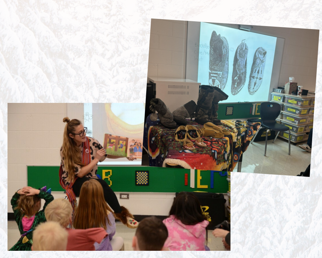
Rock your mocs @ Buchanan