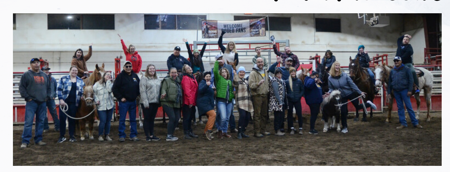
Indigenous Education Professional Learning!