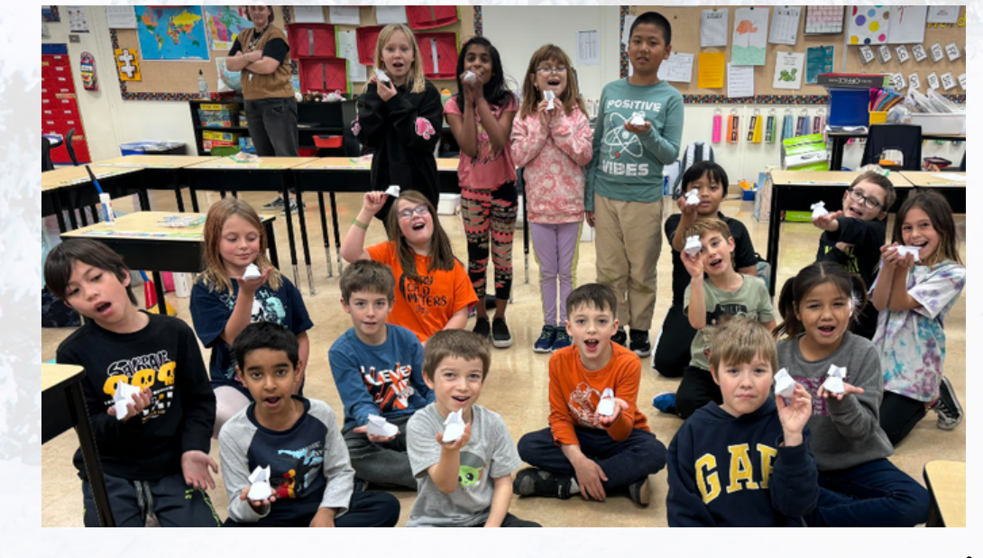
Rock your mocs @ Fleetwood