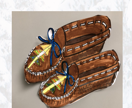
Rock your mocs @ Westminster