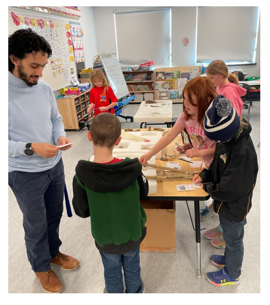
Students from Immanuel Christian Elementary School learned about the Buffalo and the Inuit.